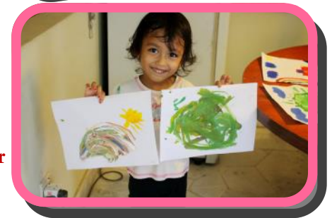
My daughter's painting for Mother's Day